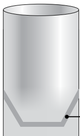
Angle Heat Seal *Protects Corners