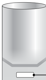
Handle Seal *Protects Hands